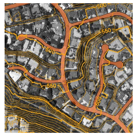
Topographic contours (orange, with 10-foot contour interval) overlaid on portion of orthoimage (0.15-meter cell size), both obtained from County of San Diego. Street overlay (red fill) traced from same orthoimage for testing. Area has 200 feet (60 meters) of relief from lower right to upper left; width of area is 440 m.