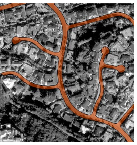
Street vector overlaid on IKONOS pan image after RPC orthorectification. Rectification successfully removed terrain relief effects from the image, so there is now excellent registration with the planimetrically-correct street overlay.